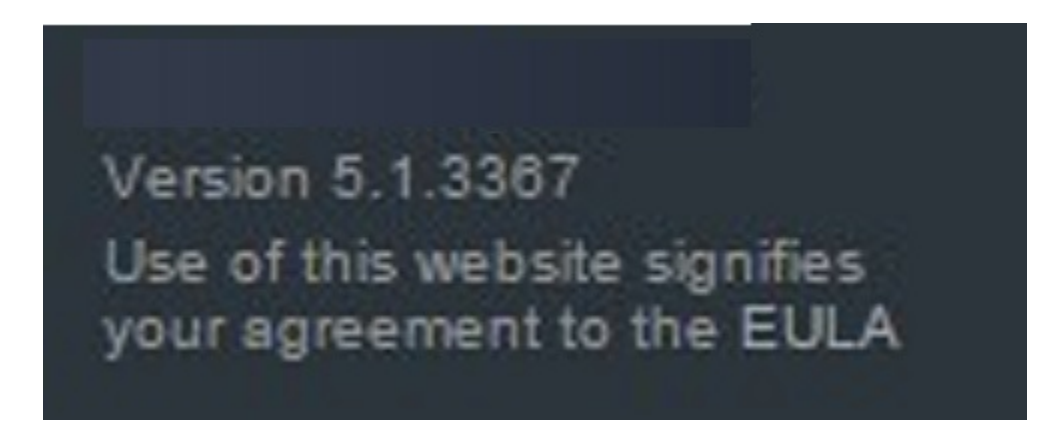
FIGURE 3 Current Cloudpath Version Lower Left

The Cloudpath version is displayed in the lower left corner of the Admin UI, and it is visible on all pages.